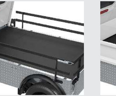
FOLD-DOWN STAKE SIDES