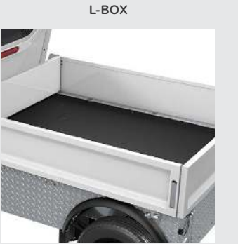
FOLD-DOWN SOLID SIDES