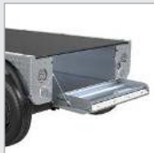
COVERED BED HINGED TAILGATE

Rubber or carpet floor mats • Windshield washer • In-windshield defrost • Heater • Stereo • Tilt steering • Right hand drive steering • Electronic power steering • Two-tone gray seats • LED headlights • Rear window • Front or rear bumpers • Rugged rear bumper with 1 ¼ in. (3.2 cm) receiver • Red, White, Blue or Black body color • Aluminum wheels • Beacon light • Light bar • Cupholder • Underseat storage • Rear cargo net • 3kW or 6 kW J1772 Charger • Rear carrier options