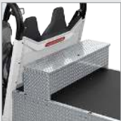
FRONT TOOL CHEST