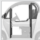
QUARTER HARD DOOR