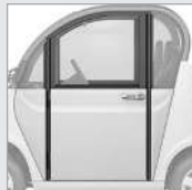
FULL HARD DOOR