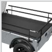
FOLD-DOWN STAKE SIDES