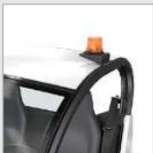
SECURITY LIGHT BEACON