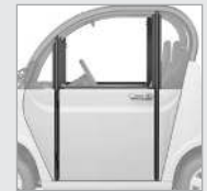
HALF HARD DOOR