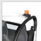
SECURITY LIGHT BEACON