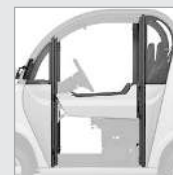
QUARTER HARD DOOR