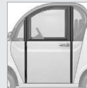
FULL HARD DOOR