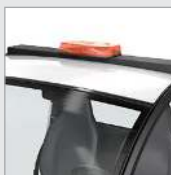
SECURITY LIGHT BAR